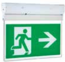
Emergency Exit Light