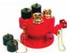
Four Way Inlet Breaching