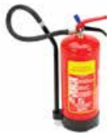
Wet Chemical Fire Extinguisher