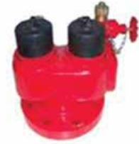
Two Way Breaching Inlet Breaching