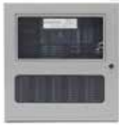
Fire Alarm Panel Advance