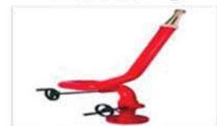
Stand Post Type Water Monitor