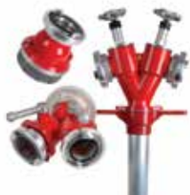
Fire Hose Dividing Breaches