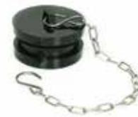
Landing Valve Rubber Cap