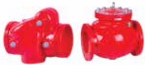
Fire Fighting Check Valves