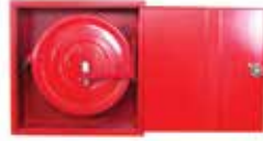
Fire Hose Reel with Box