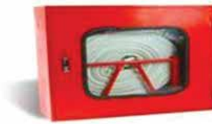
fire hose box