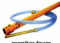
monitor foam branch pipe