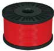
Fire Proof Cable