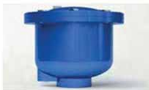
air release valve