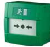
Emergency Door Release