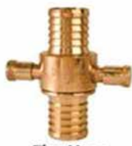
Fire Hose Delivery Coupling