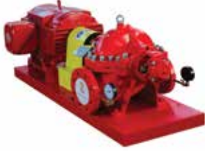
UL & FM Approved Fire Pumps