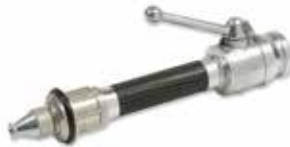
Fire Hose Nozile