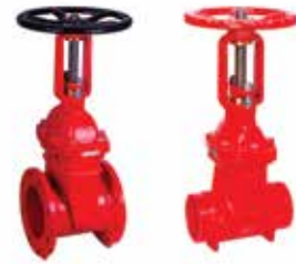
Fire Hydrants Accessories