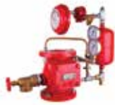
Alarm Check Valves