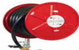
Hose Pipe Reel