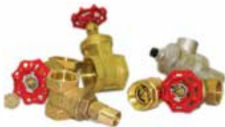
High Pressure Valves