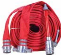
Canvas Hose With Coupling UL